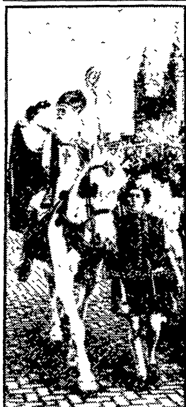
ST. NICHOLAS — Garbed as was his namesake, a fourth-century bishop of Asia Minor, "St. Nicholas" rides through the streets of Amsterdam, The Netherlands. Feast of the good saint, traditional bringer of gifts to Dutch children, is celebrated on Dec. 6. For centuries, Christmas was purely a religious holiday in Holland, but the gift-giving custom has since spread to embrace Christmas Day.

Without a leavening of those who live by the Beatitudes, what a world we would live in!