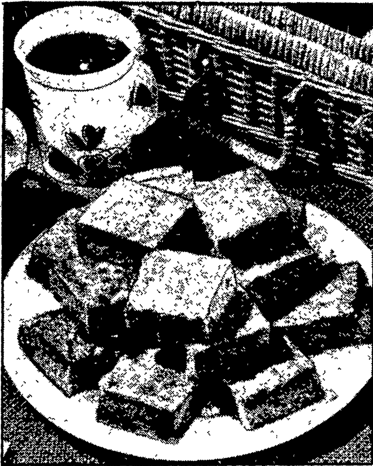
Paleface brownies and a hot beverage—wonderful combination for a snack on winter evenings. Cut down on kitchen chores—use paper plates and cups when serving late-evening goodies.

Two cups sifted cake flour, 1 teaspoon baking soda, ¾ teaspoon salt, ½ cup creamy peanut butter, ¼ cup shortening, 1 cup firmly packed brown sugar, 1 teaspoon vanilla extract, 2 eggs, ½ cup milk, ¼ cup vinegar. Sift flour, baking soda, and salt together. Cream together peanut butter, shortening, sugar and vanilla extract until soft and smooth. Beat in eggs until mixture is light and fluffy. Add dry ingredients alternately with milk and vinegar, begin-