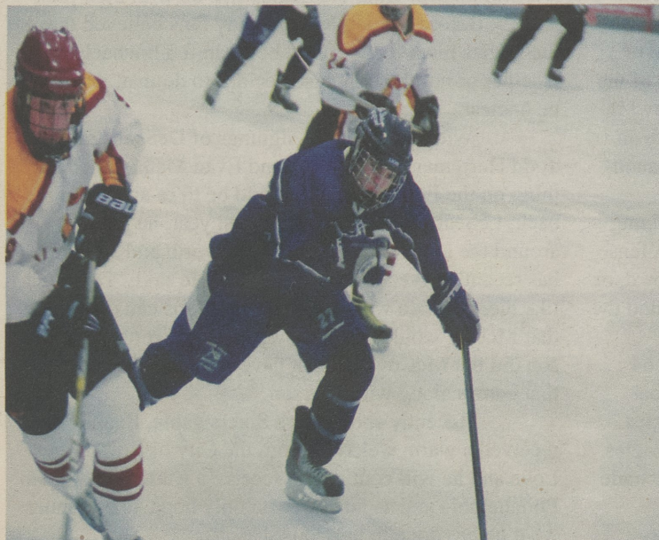
Hockey player getting back on defense.