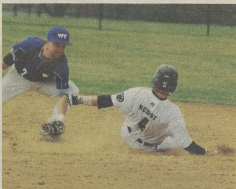
Brandywine Baseball sweeps Williamson Trade in a double header last sunday!

Good Luck Penn State Brandywine baseball, as you move on in your season!