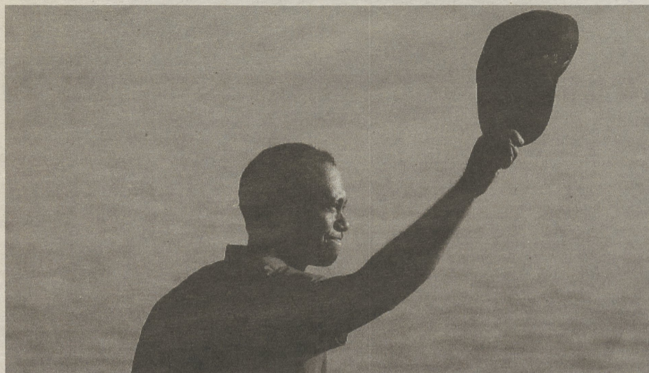
Tiger Woods tips his cap to the gallery at the Arnold Palmer Invitational after picking up his first victory after a 30 month drought.