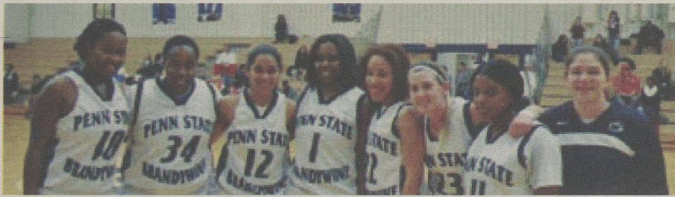
Photo of the seniors at "Senior Night" for the women's basketball team.

The Penn State Women's Basketball team fought hard all year long to make it to the PSUAC championship game against top seeded Penn State Fayette. In order to get to this game they had to make it through some tough competition.