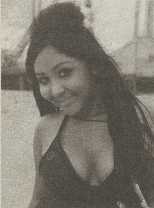
To you, she's Snooki. To the ones who she is closest to, she's just Nicole. Don't be a hater.