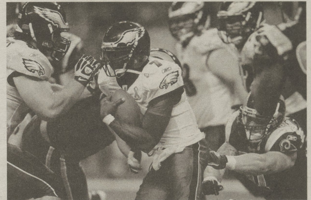
Michael Vick #7 of the Philadelphia Eagles rushes against the St. Louis Rams at the Edward Jones Dome on September 11, 2011 in St. Louis, Missouri. The Eagles beat the Rams 31-13. (September 10, 2011 -)

game for the Falcons. Even though Maclin dropped that pass, he had a breakout performance catching thirteen passes for 171 yards and two touchdowns.