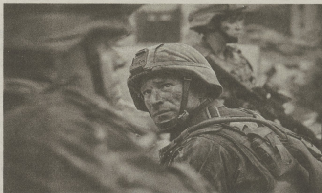
Actor Aaron Eckhardt starts in Battle: Lost Angeles , a post-apocalyptic tale of aliens taking over the world.

By Paolo DiPaolo-- Lions Eye Staff Writer -pod5013@psu.edu