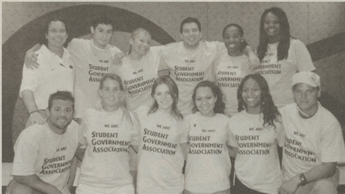
Penn State Brandywine's 2010-2011 Student Government.

The Pride Party's 2010 Intent to Run form listed several objectives which they intended to focus on during their time in office. These objectives included improving school spirit, getting more faculty and students involved, making students want to stay on campus during common hour, ensuring an environmentally friendly campus, keeping the campus diverse, relocating the school store, and improving communication between the SGA and the student body. Reviewing their party objectives leaves a sense of disappointment and frustration because almost none of what they promised the student