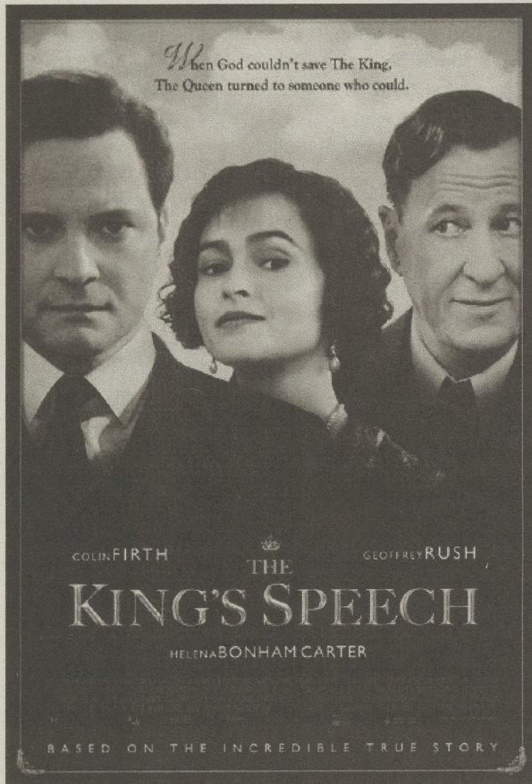
The King's Speech, in theatres now, stars Colin Firth, Helena Bonham Carter, and Geoffrey Rush. The film is one of the most talked about movies of the year.