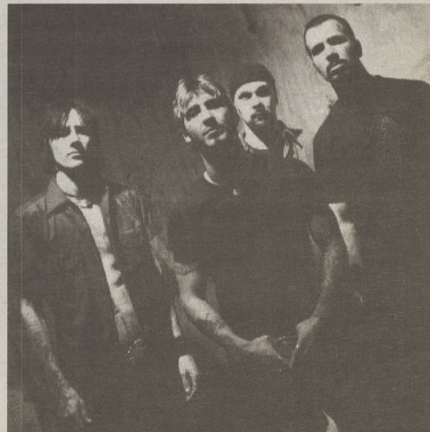
Legendary rock band Godsmack recently rocked the Camden riverfront with their haunting blend of heavy metal, acoustic rock, and alternative rock.

Overall, it was a good show. Drowning Pool's set was too short in my opinion and while Five Finger Death Punch had a quality set, the sound system was not up to par with the rest of the show. Many fans complained after the set they had trouble hearing the vocals. Godsmack gave a quality performance but I feel as though their set list was short and lacked the old school songs that made many listeners diehard Godsmack fans. Overall the say it was a C+ show and worth the price of admission.