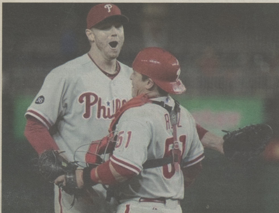
Roy Halladay and Carlos Ruiz celebrate the final out of the N.L. East clinching game against the Washinton Nationals