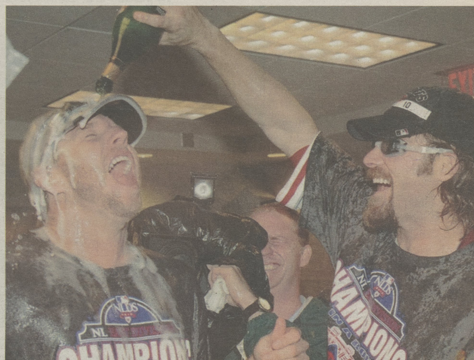
Jayson Werth and Roy Halladay continue the celebration in the club house