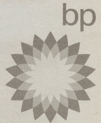
The ramifications of the Deep Horizon oil rig accident will have serious impact on our generation for years to come.

Does offshore drilling affect gas prices? Did the BP oil disaster really affect us? These questions are next to be answered.