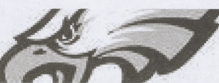
The Eagles Drafted DE Brandon Graham with the 13th Overall pick of the NFL Draft