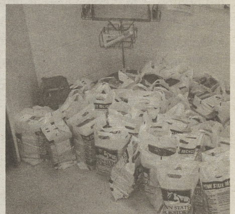
Scenes from A Sale (clockwise from top left) Tables and tables of books are available for purchase; Selling and organizing; Bags of books are donated; PSU Brandywine students take advantage of a beautiful spring day to garner business; A sale is made.