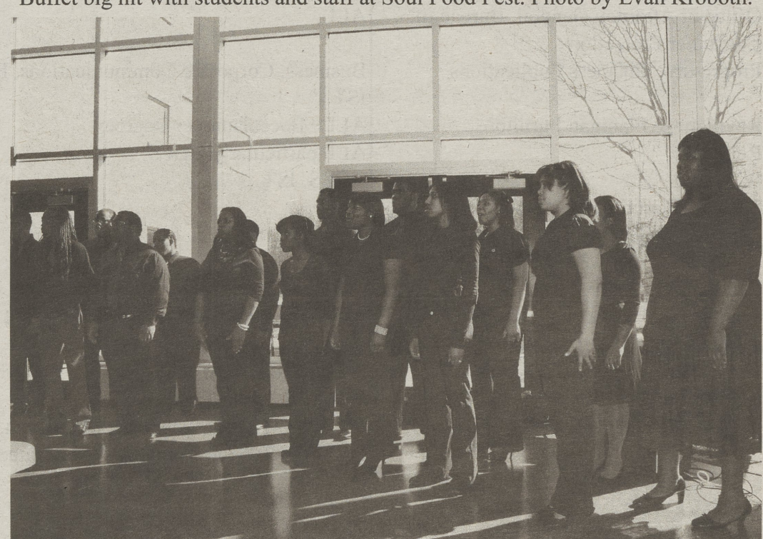
Cheyney University Choir performing in the Tomezsko Lounge.