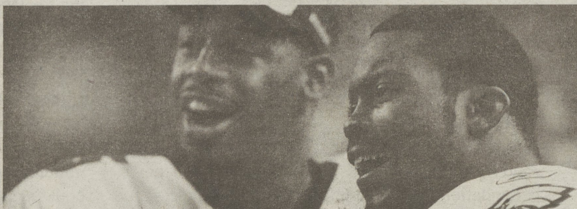
Donovan McNabb and Mike Vick are likely to be moved this offseason.

However, the Philadelphia Eagles selected Kevin Kolb as their first pick in the 2007 draft for a reason. The 25 year old quarterback has been "seasoning" on the sideline for the past three seasons, waiting for his opportunity as a starter. Kolb has impressed many in his brief time starting for the midnight green in the 2009 season. He threw for over 700 yards and four touchdowns. Kevin Kolb has said that he is ready to be