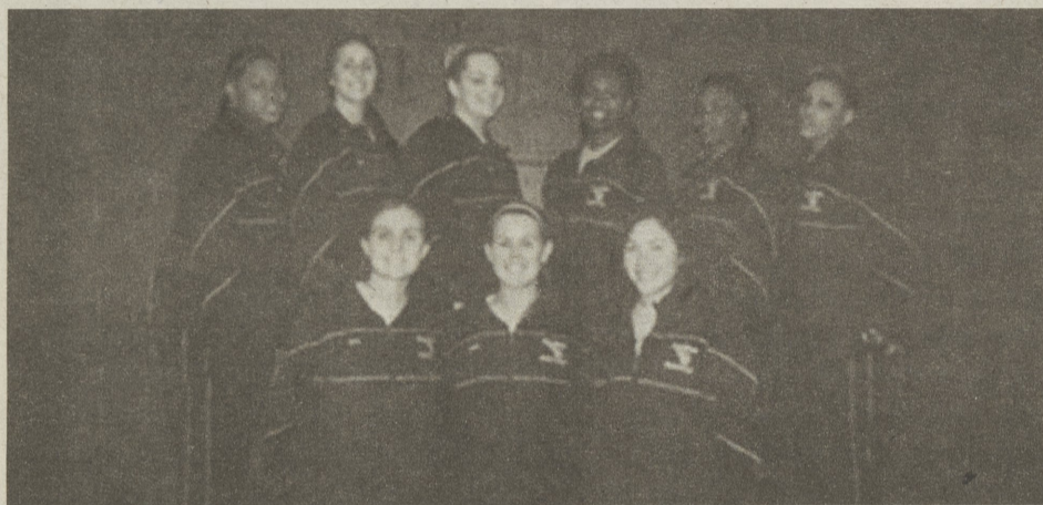
The Brandywine Lady Lions Basketball Team

The Brandywine Lady Lions have beaten some quality opponents during the course of the season this year. They have impressive victories over York, Abington, and Briarcliffe. The team's last big and impressive victory came against Dubois at their home court.