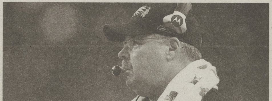
Andy Reid is expected to receive his contract extension in the near future

During the past three games, Reid seemed to change his philosophy and it has produced consecutive victories. Time management has become strength of the team, as quarterback Donovan McNabb engineered two game winning drives in the fourth quarter. LeSean McCoy and Leonard Weaver both powered a running game that had been nonexistent in