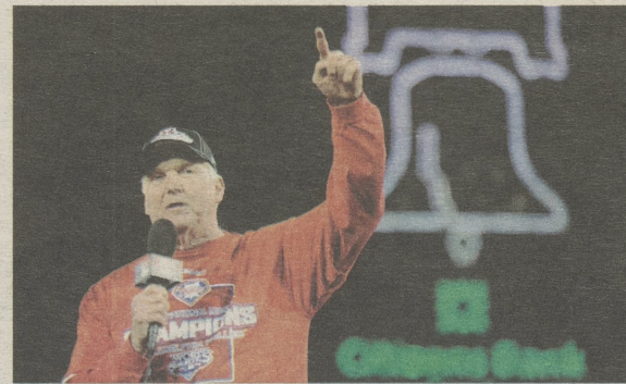
Charlie Manuel speaks to the crowd after the 10-4 victory over the Dodgers

The Philadelphia Phillies are once again the National League Champions and are on their way to their second consecutive World Series. The Phillies become the first team in the NL to make it to back-to-back World Series since the Atlanta Braves did it in 1995 and in 1996. The Phillies became the fifth club to win back-to-back NL titles since 1969.