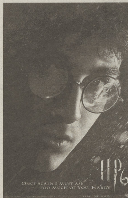
Films like Harry Potter and the Half Blood Prince are anticipated to be huge summer blockbusters for 2009.

Basically, in my own pessimistic opinion, this summer is beginning to look like a weak one, but fear not, with the new school year comes a handful of new movies and from what I've seen it's going to pick up from there. I don't care what you say, Where the Wild Things are kicks ass. Have a great summer and I hope to see you at the movies, you know I'll be there.