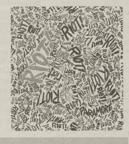
Paramore's album, Riot

By Nancy Perone - Lion's Eye Staff Writer - nip5014@psu.edu