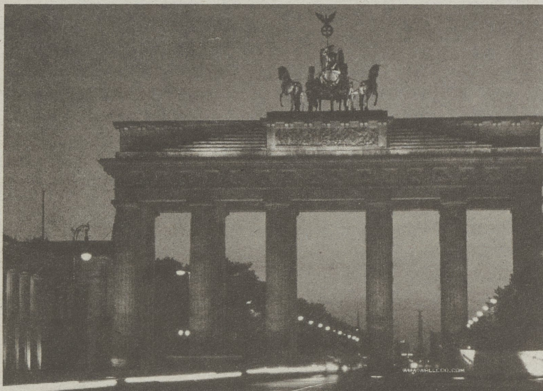
Brandenburg Gate in Berlin, Germany.