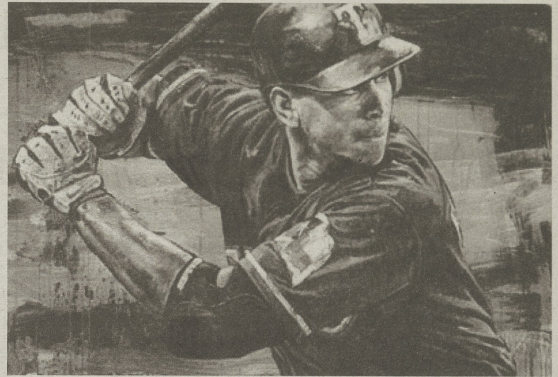
Alex Rodriguez as a Texas Ranger.

What is next for Rodriguez? Will this confession set him up for a tear in 2009? What will the Commissioner, Bud Selig, do about this? Will he suspend A-Rod or take some of the "dingers" away from his total? Only time will tell.