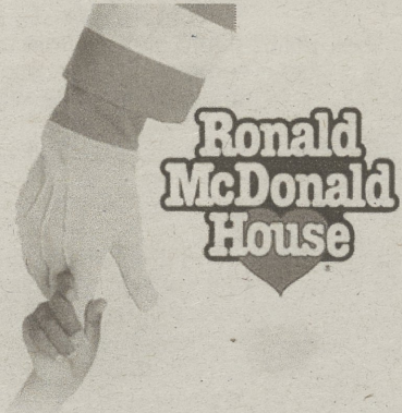
Ronald McDonald House logo.

This is an amazing opportunity to gain a new perspective on life and to contribute to a great cause so please come and participate in this event.