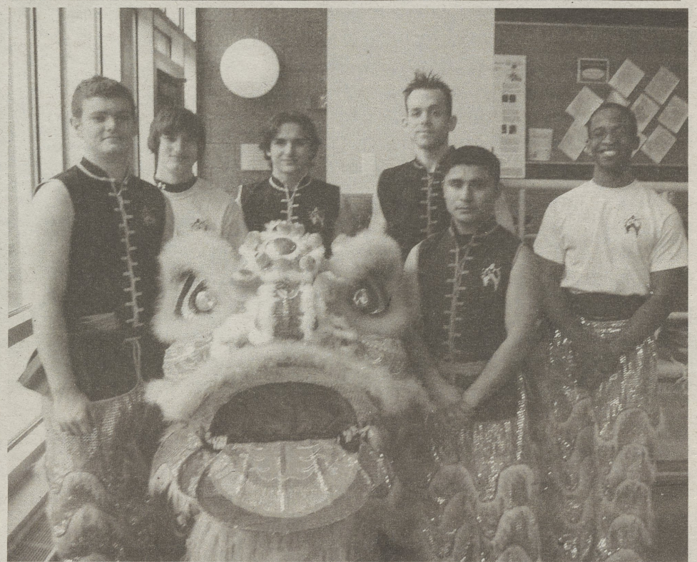
Top: The Tam Yim Lion/Dragon dancers performing the Chinese Dragon Dance Bottom: Members of the Tam Yim Lion/Dragon Dance