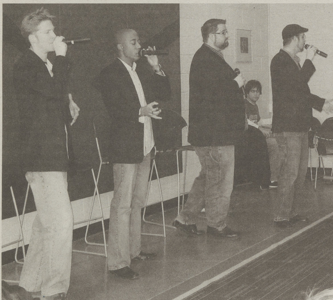
The Home free Acapella singing group performed on Wednesday, January 14th during common hour in the Lion's Den.