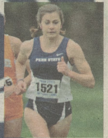
CO-ED CROSS COUNTRY