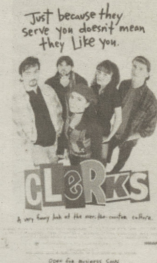
The movie that defined the slacker generation.

The film Clerks depicts a gritty, black & white view of the boring lives of a retail clerk. Not a lot happens in the movie and it's completely driven by the compelling dialogue between the characters. Both of the main characters are miserable, the camera is constantly static and everything about the movie is delightfully simple. All of these attributes are clear throughout the soundtrack. You have the angry, miserable sounds of Bad Religion and