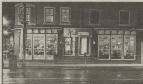
Azie in downtown Media