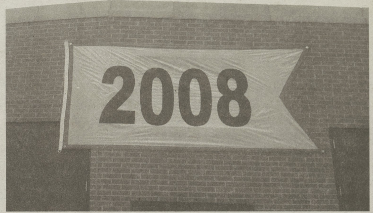
The Phils Fly High After Capturing Pennant.

As the season was coming to a close, the Phillies lead was dwindling to a few games. By the month of August the Mets were in striking distance or on top of the division. This meant that the Phillies need to have a strong finish. The beginning of September looked promising, they were closing in on the lead that the Mets had, and shaved