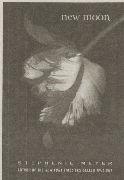
Stephenie Meyer's second installment in the best selling Twilight series.

Bella falls into a deep depression until she becomes closer friends with Jacob Black, her father Charlie's