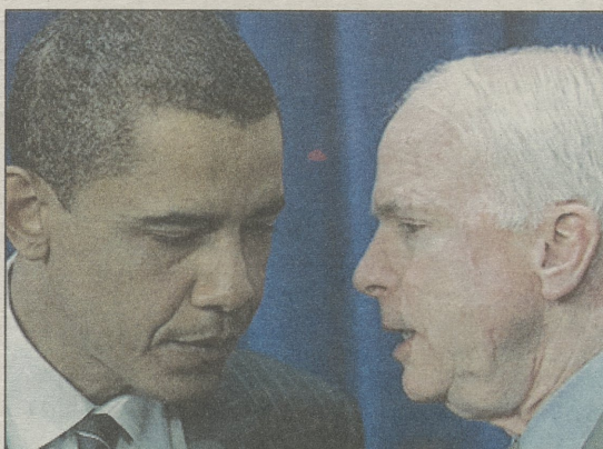
Sen. Barack Obama and Sen. John McCain.

*(D) indicates Democrat and (R) indicates Republican.*