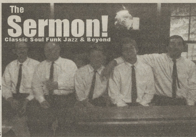
Local band The Sermon!

LeCompt, a classic rock cover band that has been around for over 25 years, plays