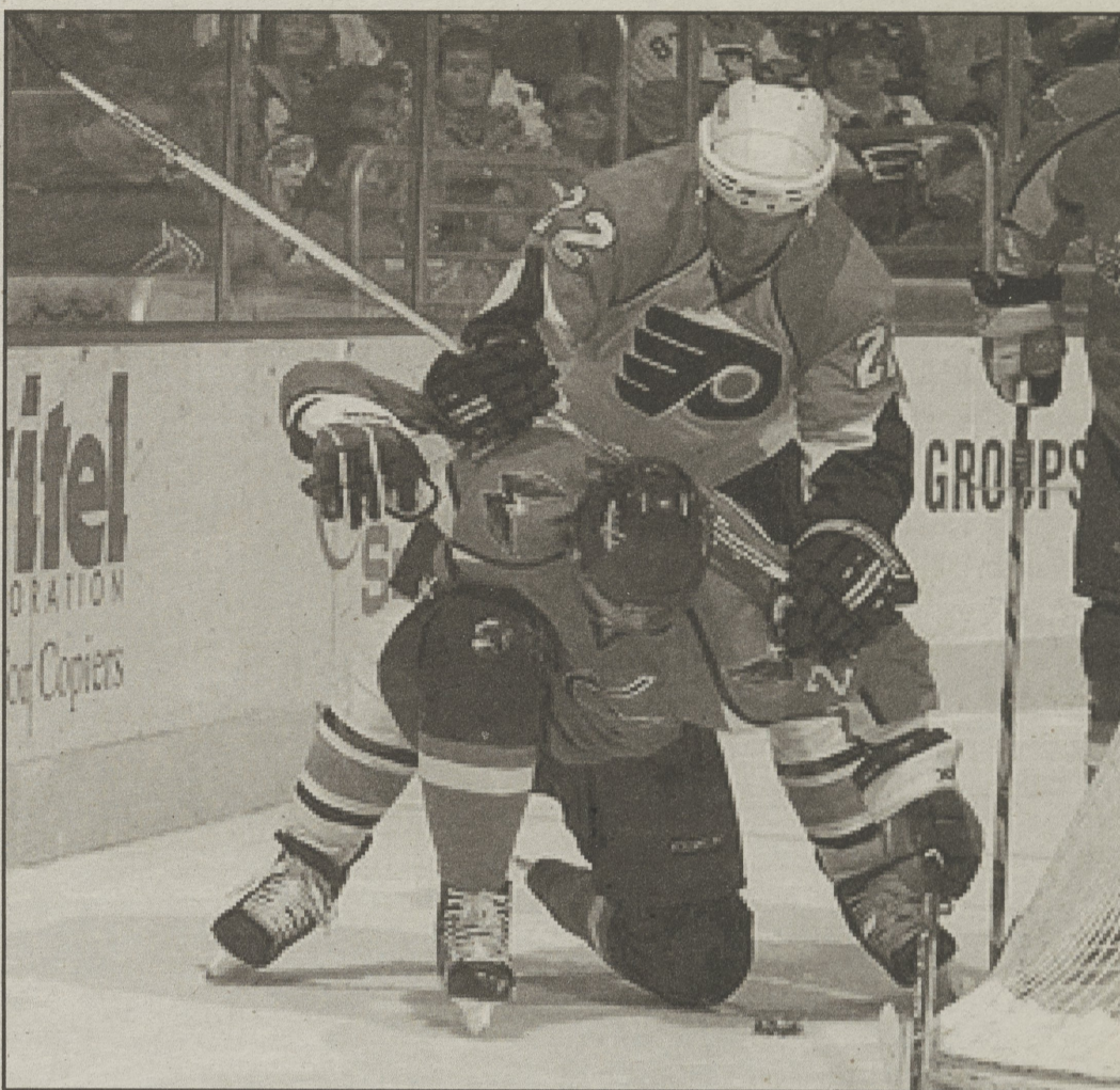
The Philadelphia Flyers play the Washington Capitals in the first round of the playoffs.

The Flyers will likely play the Pittsburgh Penguins who battle for first place in the Eastern Conference. The Penguins have been very good since the All-Star break and have played very well against the Flyers recently. The beginning of the season the Flyers dominated the Penguins, but as of late, the Penguins have taken over behind Sidney Crosby and Evgeni Malkin. It should be a very good series.