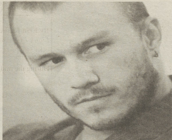
Heath Ledger prior to death.