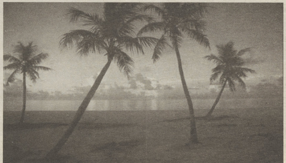
Key West sunset.

diverse with lifestyle, at night you will see things unimaginable in Philadelphia. You can relax and enjoy the scenery at many of their outdoor cafes, or join the locals at Margaritaville. Walk down Duval Street and enjoy the sunset at the southern most tip of the continental United States. Walk a few more blocks and discover Earnest Hemingway's house. Whether you are taking a morning walk or headed home after a night of Margaritaville, you will see there is always something to be found. Traveling to Key West is like leaving the country, only you won't need a passport. The peaceful yet energetic island will leave you wanting more and thankfully, it's only a quick flight away. If you're searching for a little paradise this spring, look no further than Key West Florida.