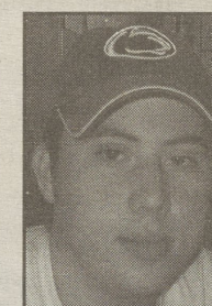
Old School Batman