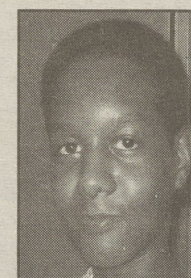
I don't celebrate Halloween.