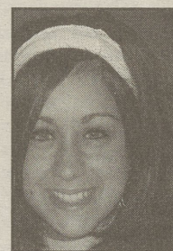
I want to be an Acme employee.