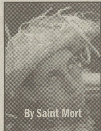
By Saint Mort

If you were there that dreadful night, contact Saint Mort at mjk5039@psu.edu .