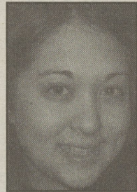
My pink simple plain shirt!