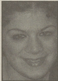
"I Love Lucy" on DVD.