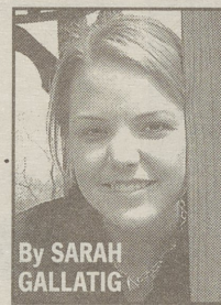
By SARAH GALLATIG

But most of all remember, it only takes one time to make a mistake that could cost lives.