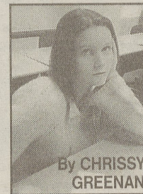
By CHRISSE GREENAN