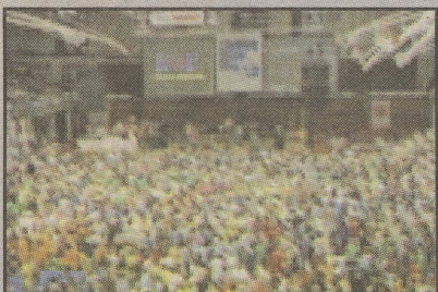
The entire Penn State community gathered in University Park for THON, and the Delco campus was well represented.