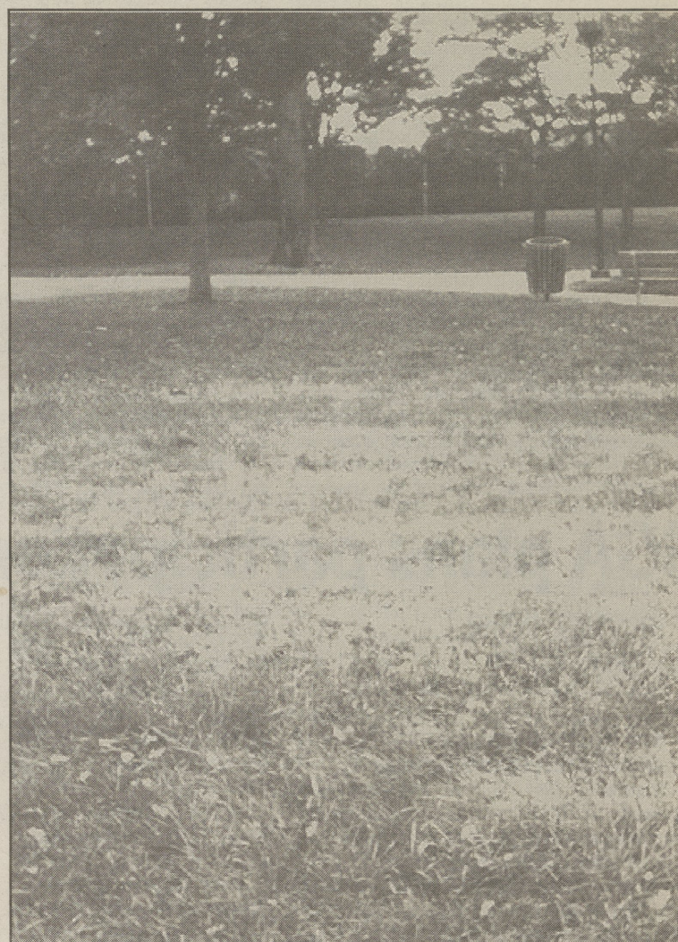
A painted outline marks the spot on the campus, near the Commons Building, where a sculpture of the Penn State Nittany Lion will soon stand.

If all goes well, the lion is expected to return home in two to three weeks.