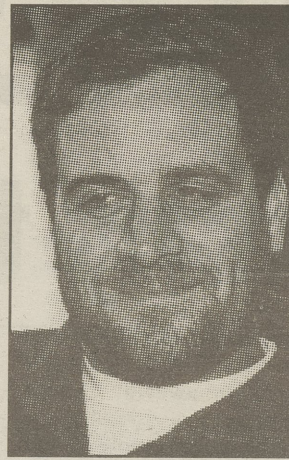
"E-IR, Bloop Bloop."