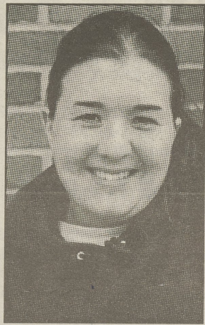
"The education and the people I met."