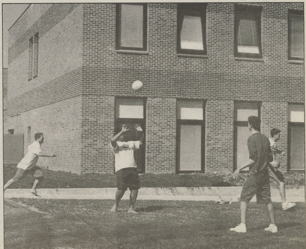
Sophomore Pradeep Kulkarni sets the volleyball to his friend outside of the commons building on March 27. Students were taking full advantage of the warm weather which reached upwards of 65 degrees.

SPRING HAS SPRUNG See related story and photo ... Page 4