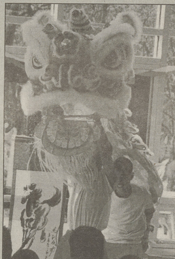
(Above-right) The colorful lion dances to bring prosperity, good health and good fortune to all. Lion dances take place throughout the first few days of the Chinese New Year. The Lion Dance itself is performed by two 'dancers' one at the head and one at the tail of the lion. The dance is accompanied by loud music