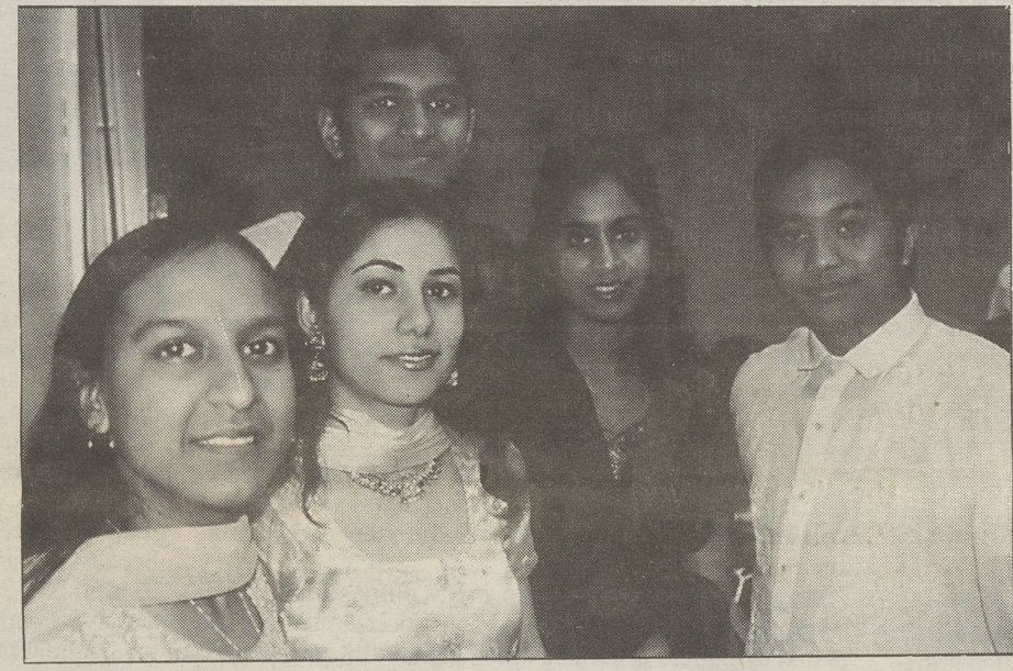
Penn State Delco students are all smiles taking part in a multicultural fashion show.