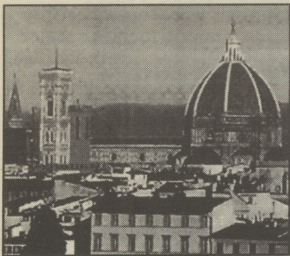
The skyline of Florence, Italy

To find out complete details about any of the trips here including any extraneous costs, visit http://outreach.psu.edu/PSSEA/ . Applications are included in the yellow pamphlets published for each trip, which are located in the main building's main floor hallway. Applications can also be accessed through the website.