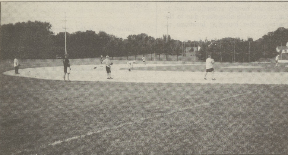
There's no shortstop shortage for Delco Baseball.