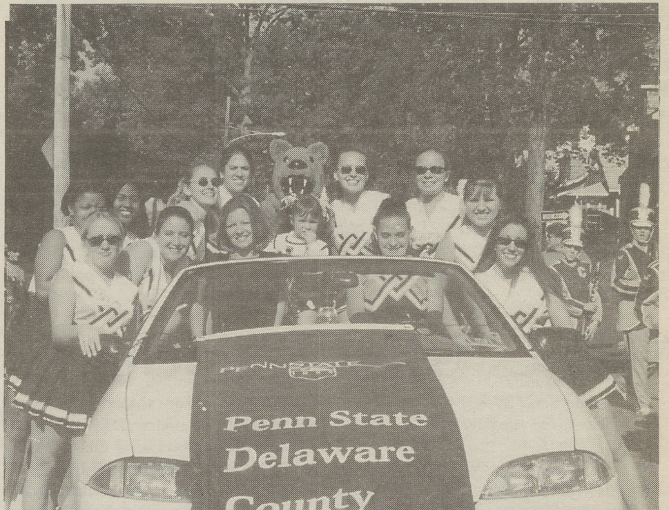
Delco cheerleaders showed their spirit at Media's Halloween Parade as one of their service projects for the campus. They will be cheering at the men's and women's basketball games starting next month.