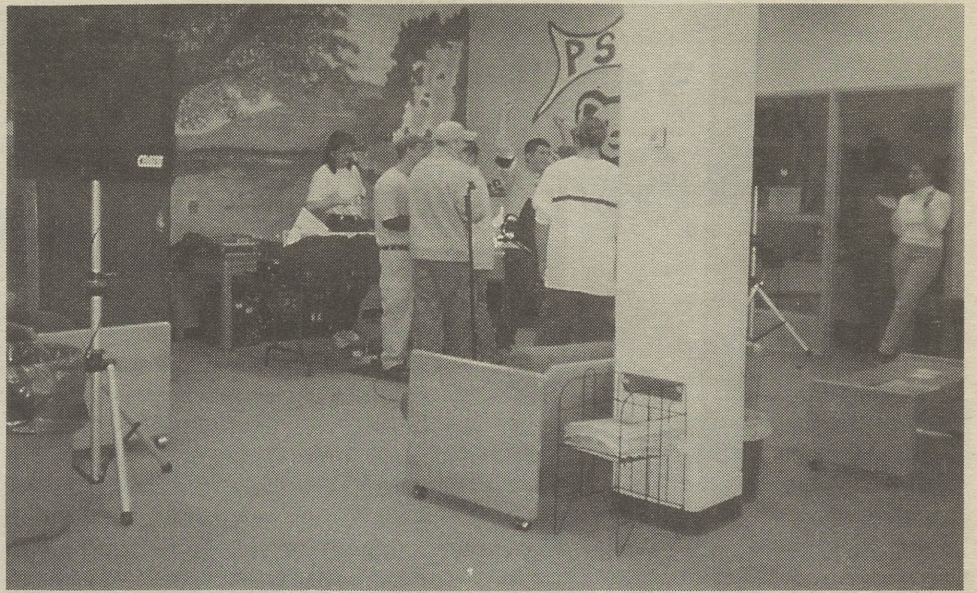
During Freak Week, Delco students sing a rendition of Limp Bizkit's "Faith."