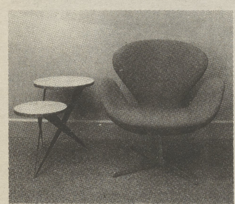
Arne Jacobson Swan Chair, Mode Moderne

First Friday is a unique cultural event in Philadelphia and one of the city's most popular evening escapes. Held the first Friday of each month, from 5 PM to 9PM in the art galleries of Old City, rain or shine, this arts community's "open house" brings city dwellers and suburbanites, contemporary arts and antique collectors, aficionados of classical and contemporary design, and the-